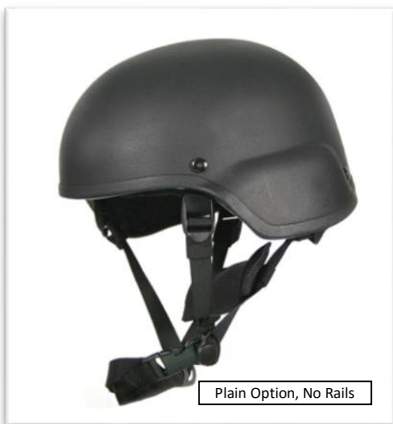
Plain Option, No Rails