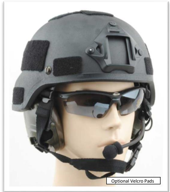
Optional Velcro Pads